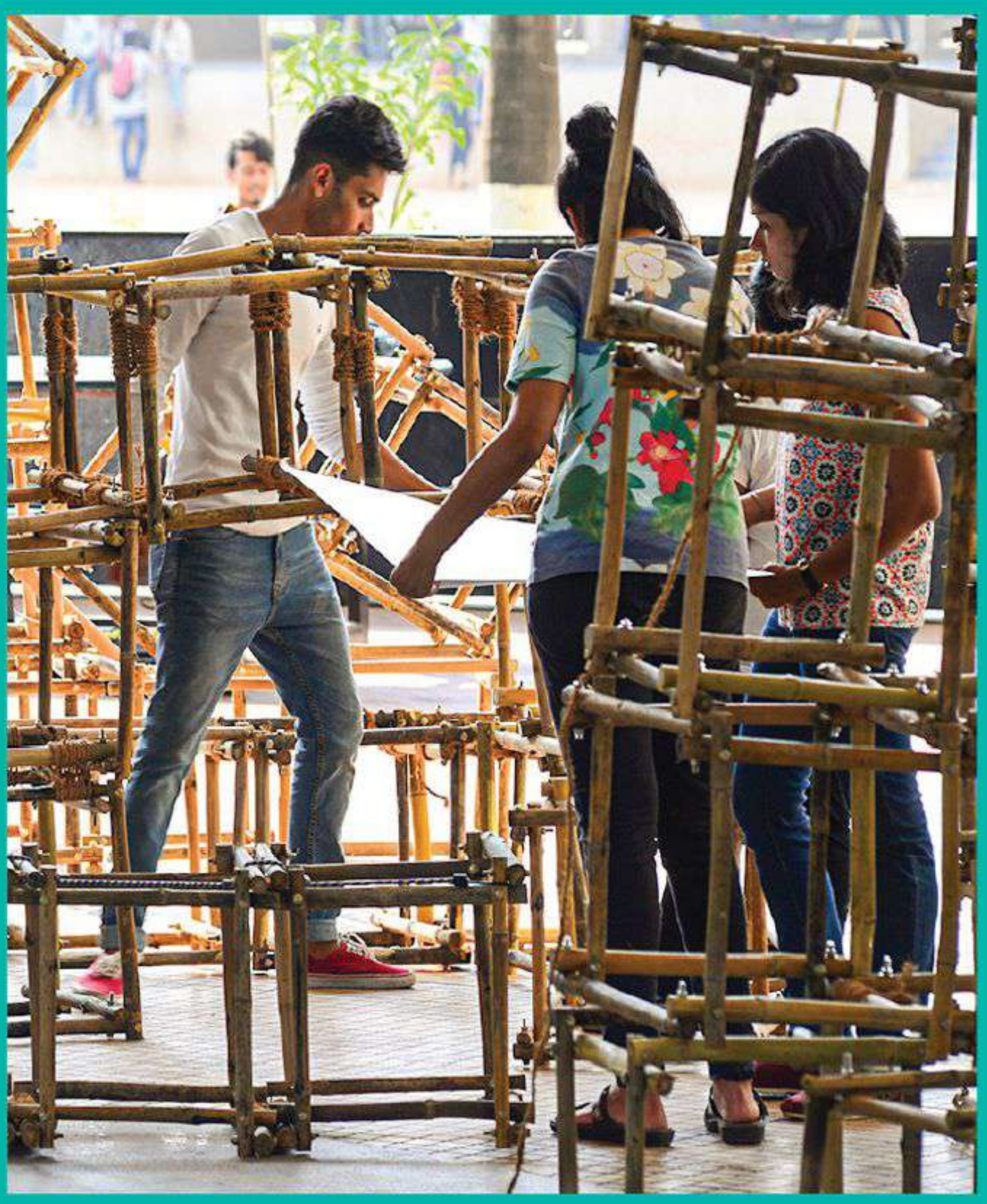
FULL SCALE 110