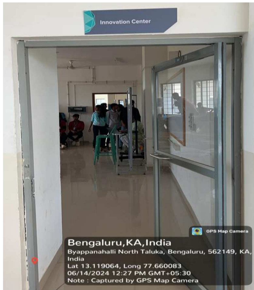
Fig 5: Signpost of Innovation Center