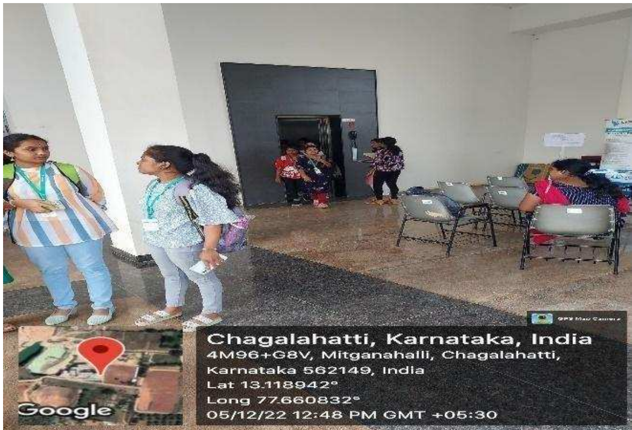
Fig 2 (a)