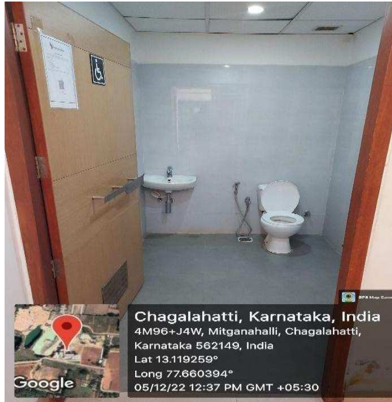
Fig 4: Differently-abled friendly washroom