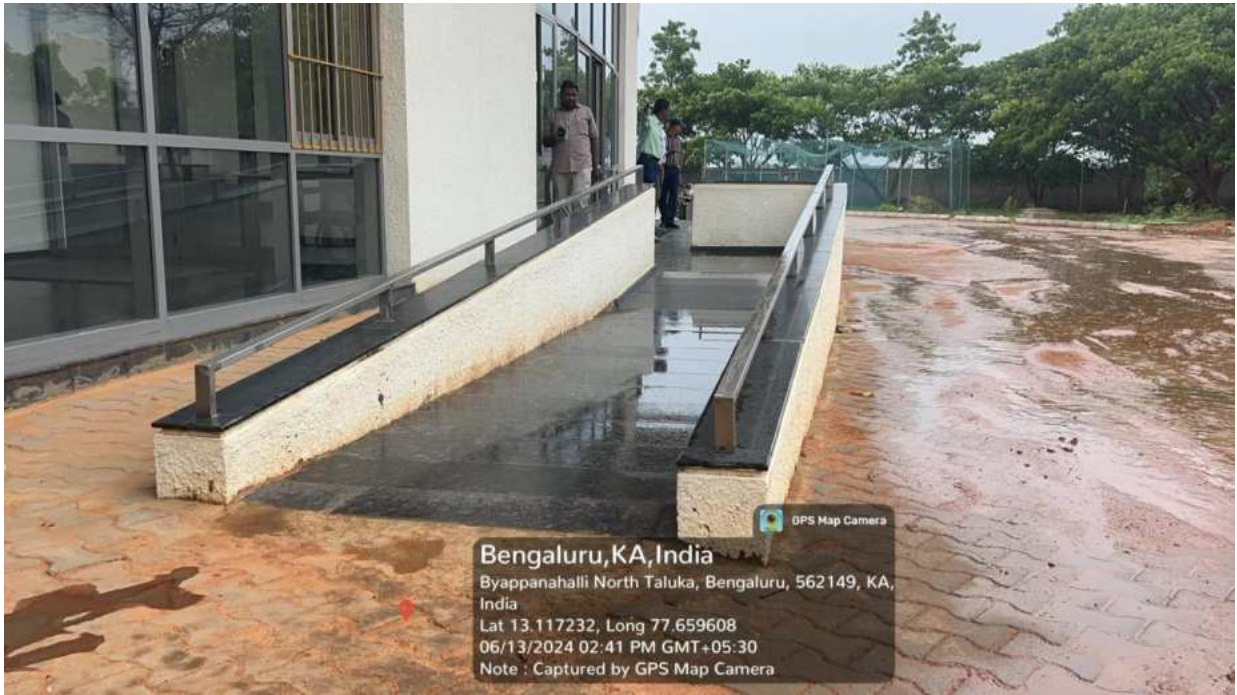
Fig 1 (f)