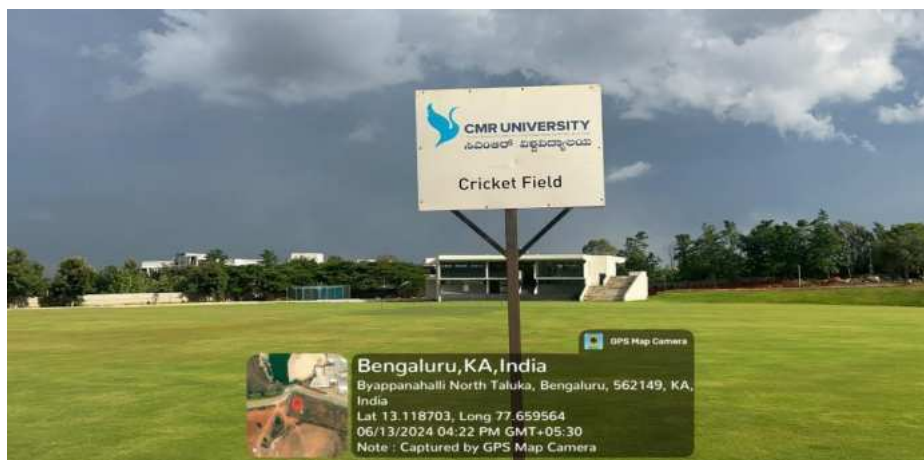
Fig 10: Signpost of Cricket Field