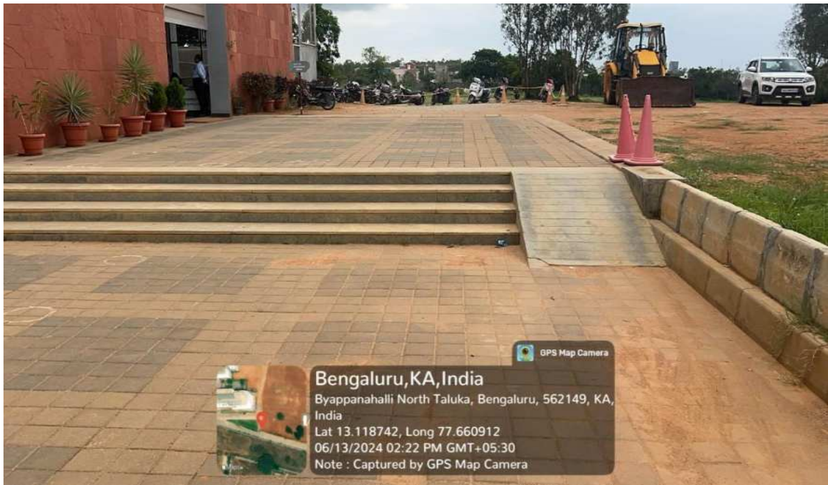
Fig 1. (a)