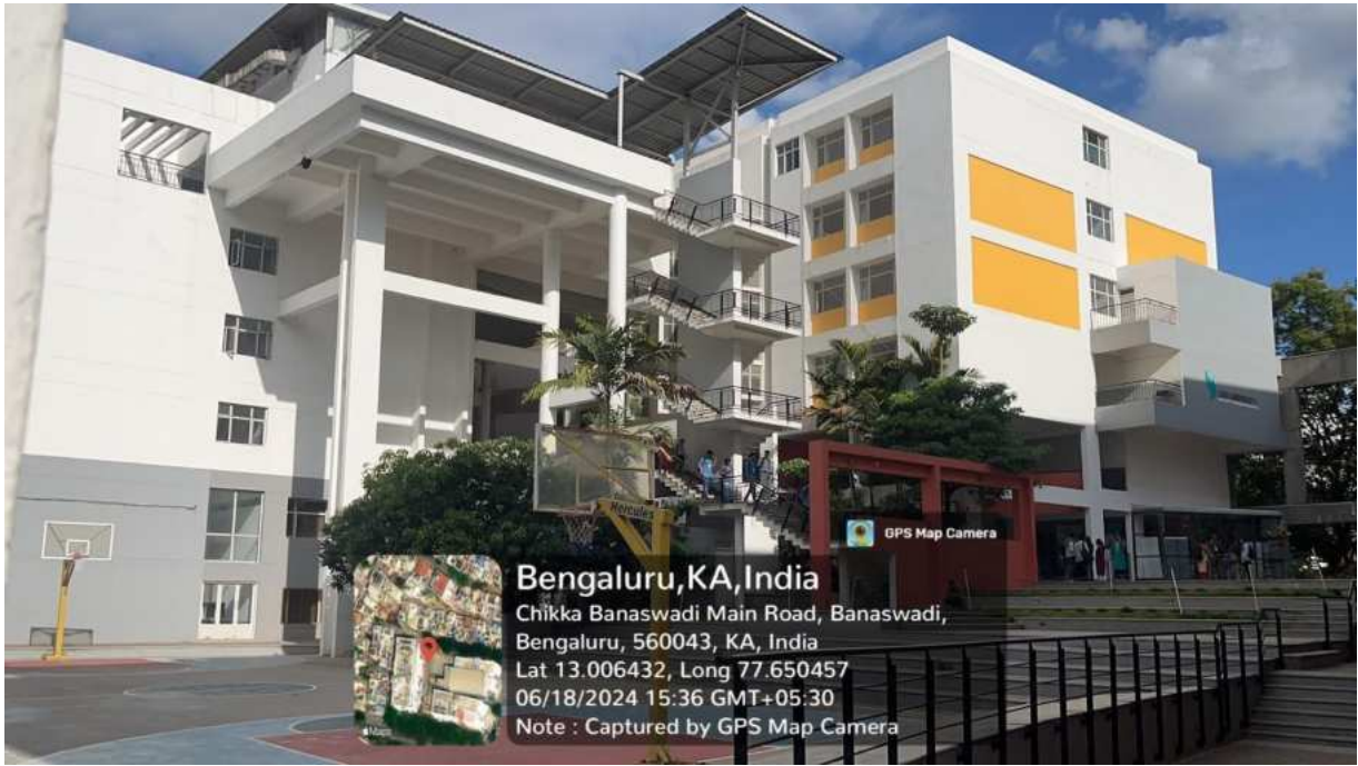
Fig 1 (a), (b), (c), (d), € , (f), (g), (h), (i) : Ramps