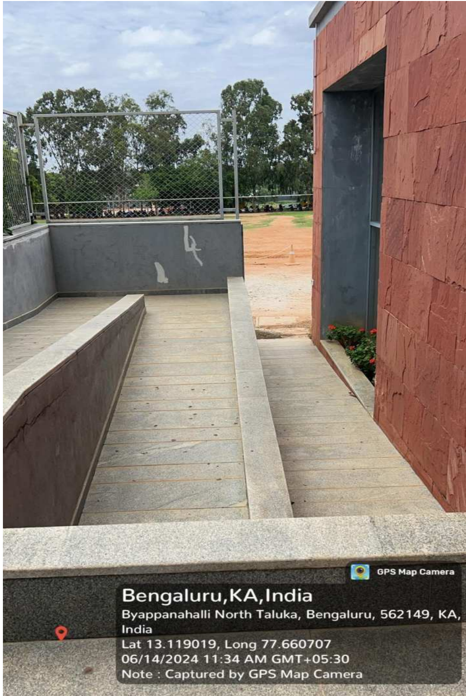
Fig 1. (e)