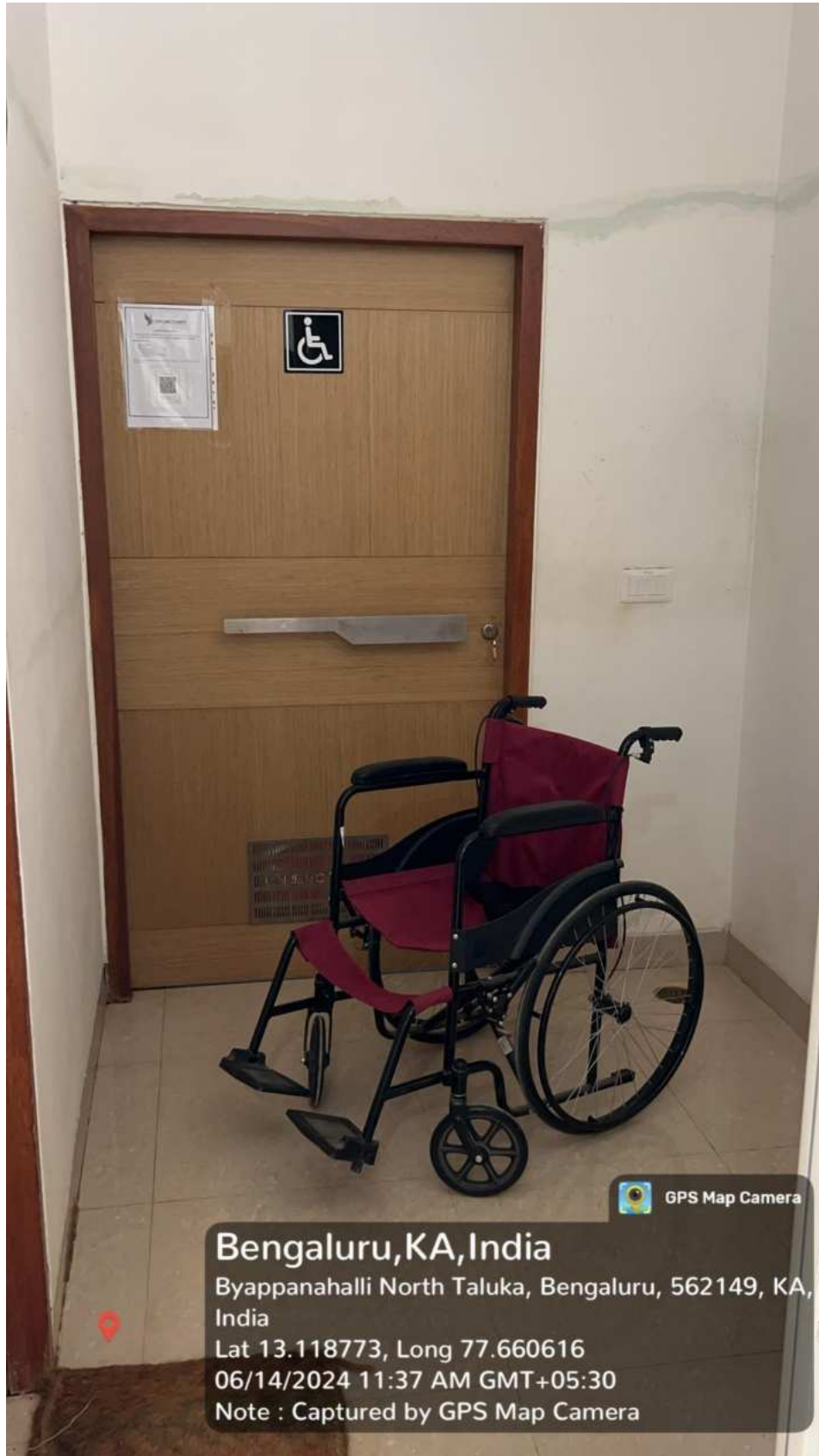
Fig 3: Differently-abled friendly chair