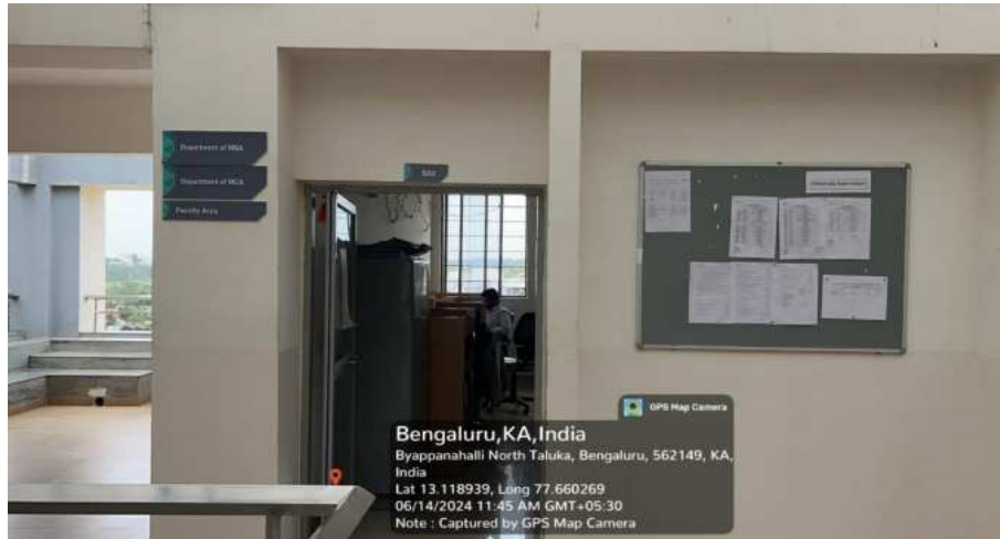
Fig 9: Signpost of Faculty Area