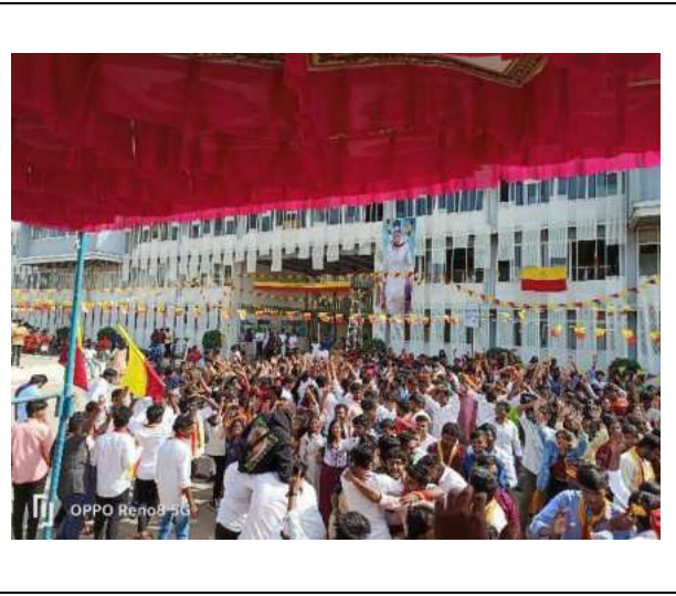
Kargil Vijay Diwas – 26 th Jul 2022