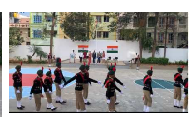
National Youth Day – 12 th Jan 2023