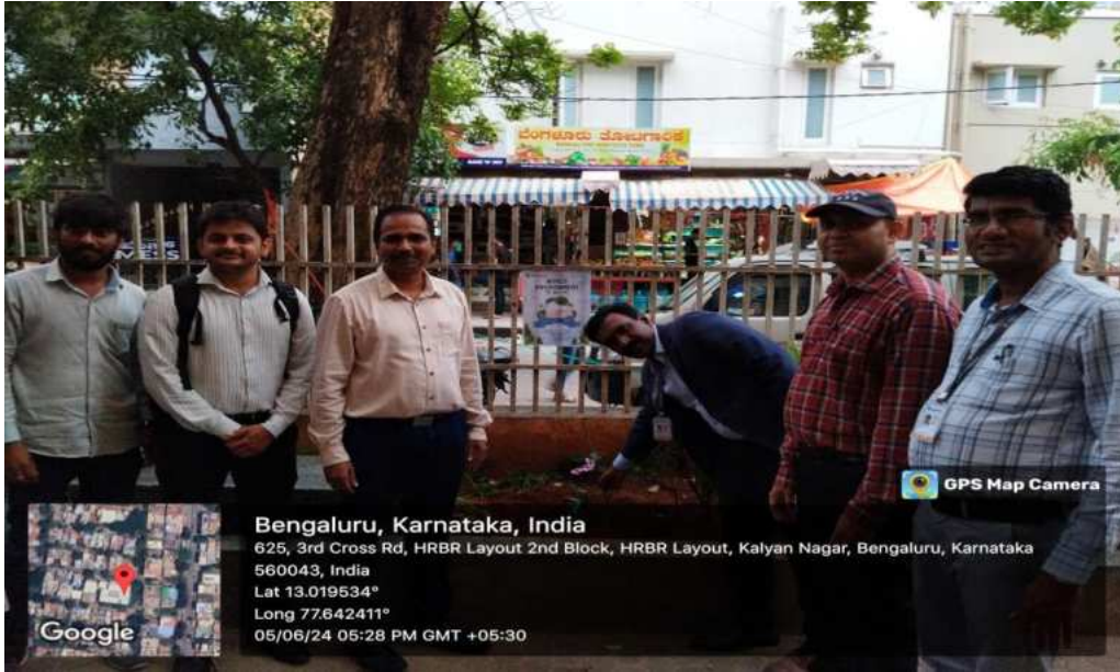
Fig 6 (a)