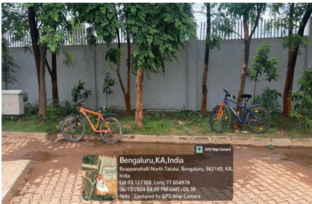
Fig 2: Battery-powered vehicle (6-seater buggy) & Bicycles