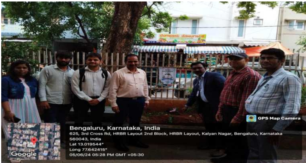
Fig. 6 (a), (b): World Environment Day