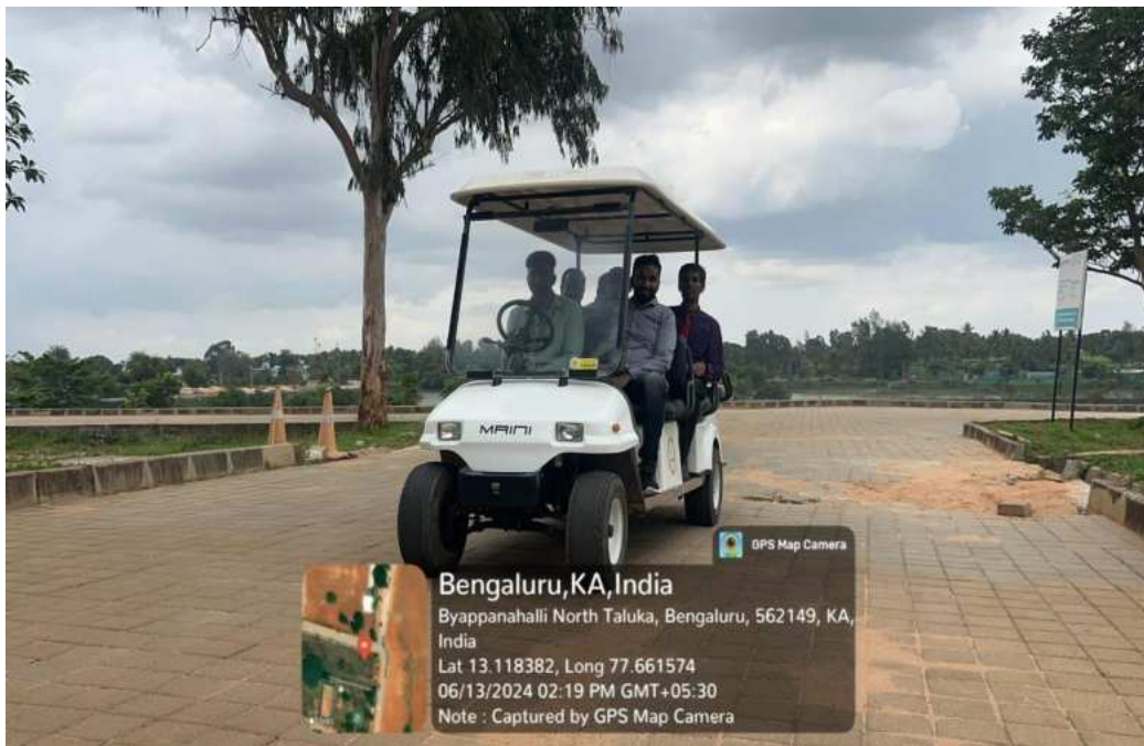
Fig 1: Battery-powered vehicle (6-seater buggy) & Bicycles