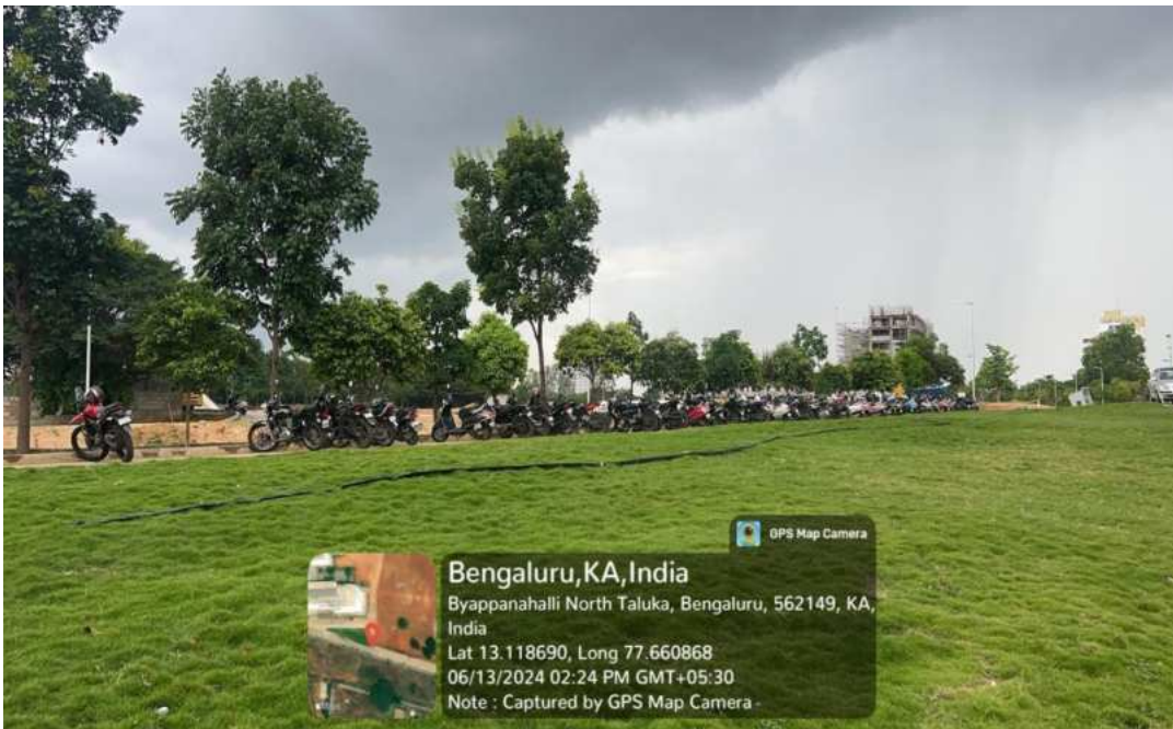
Fig 4: Restricted entry of automobiles